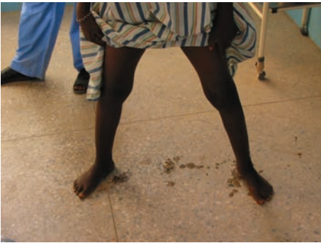
Figure 4.5 If the patient has been drinking sufficiently, urine should be seen dripping when she stands with her legs apart.

Therefore, as soon as the decision is made to operate, ask the patient to start drinking plenty of mixed fluids, only stopping 4 hours before the operation. If she has been drinking sufficiently, urine should drip when she stands with her legs apart (Figure 4.5). Set up an intravenous infusion of saline before she goes to theatre,