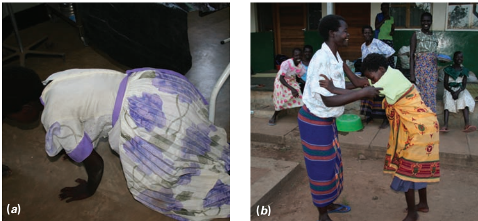
Figure 4.2 (a) This patient could only crawl 2 weeks post delivery. She has both a vesico-vaginal fistula and a recto-vaginal fistula. (b) One week later, she could just walk with support, but had bilateral foot drop. At 6 months, she just had mild unilateral foot drop. Both fistulae were closed, but stress incontinence remained a problem.

With good nursing care, the majority of patients improve (Figure 4.2). With good nutrition and active and passive movements of all joints, motor power and sensory loss will improve, although foot drop (due to damage to the L5 root) will be the last to recover (if it does at all). The provision of splints prevents contractures in plantar flexion. However, they should not be a substitute for putting all affected joints through a full range of movement several times daily. Residual foot drop, especially if a fixed plantar flexion has been allowed to develop, is a serious disability that will impair the patient's ability in daily activities.